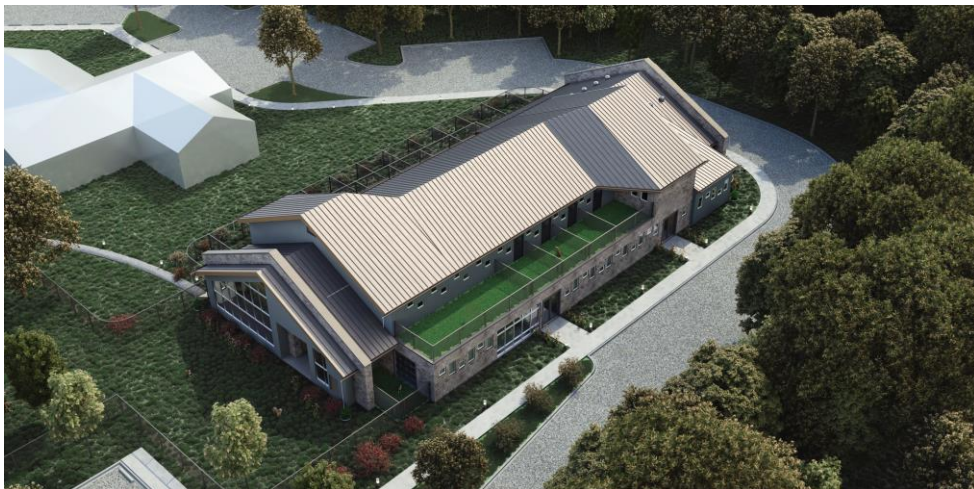
Exterior rendering of new Furkids dog shelter

The new Furkids Dog Shelter will be approximately 13,000 square feet and similar in configuration to the Cat Shelter, with fenced outdoor play yards and each dog having an individual room. The new building and enhanced configuration will enable Furkids to accommodate up to 115 dogs, doubling their current life saving capacity, while providing additional room and a more comfortable environment for our long-term residents.