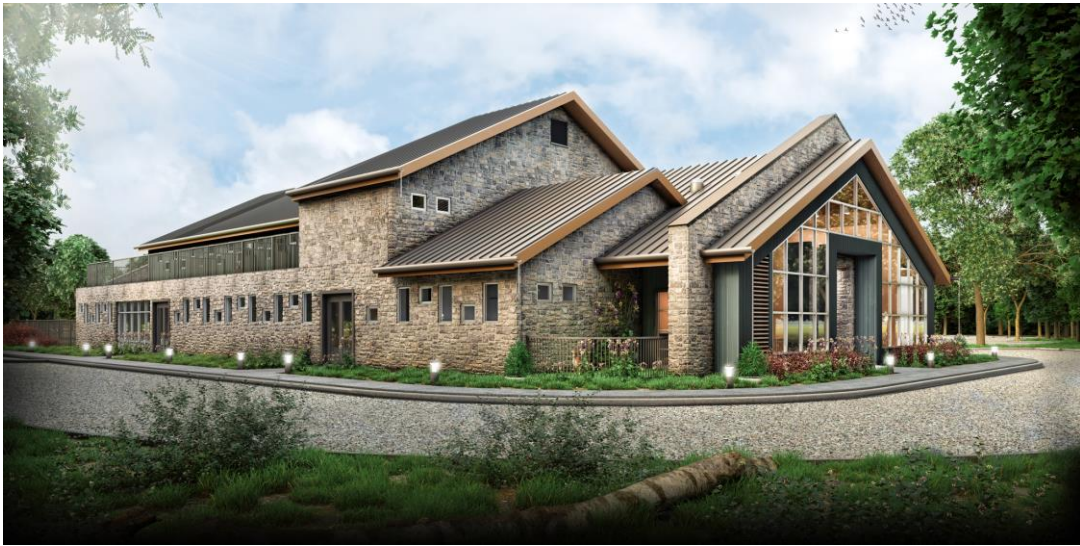
Exterior rendering of the new Furkids Dog Shelter

Cumming, Ga. 5.8.24 - Furkids Animal Rescue is raising funds to build a new state-of-the-art two-story dog shelter at their headquarters property, consolidating their cat and dog operations and doubling their ability to save canine lives. Generous donor and animal advocate, Fair Sutherlin, has issued a challenge grant - agreeing to match all donations towards the new dog shelter up to 1 million dollars.